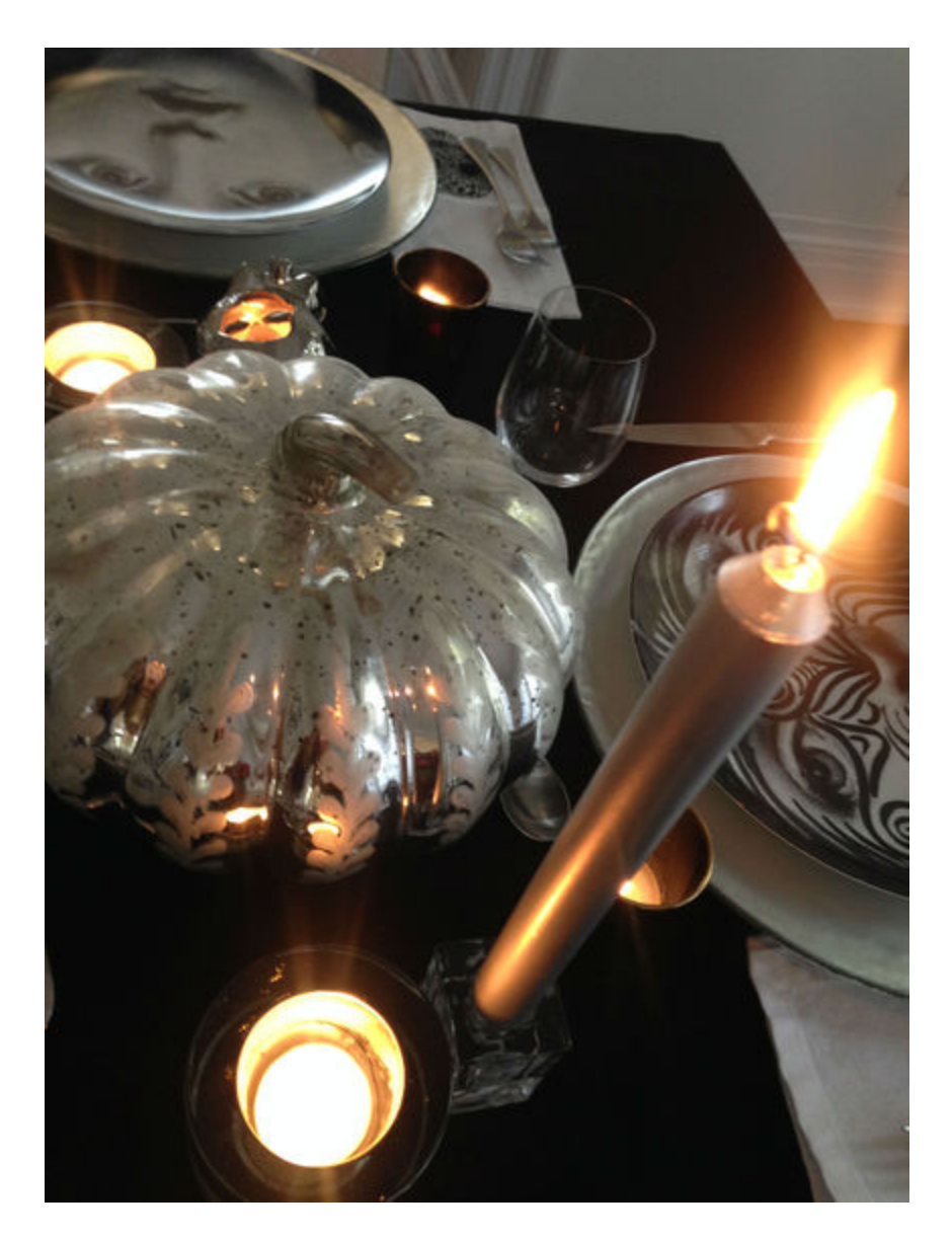
Table décor . Dump those boring old white dinner plates and find some that tell a story. Or design your own, using safe paints or decals.